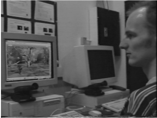
Figure 4. Controlling a panorama image viewer

of Tcl/Tk. This programming language allows researchers to do both, trigger powerful huge training processes with one single command and to control very low level features (down to single acoustic parameters) with simple commands. Tcl/Tk offers a user friendly environment with easy to implement GUIs. The gaze tracker is used to detect the user's focus of attention. When the user is looking at a window, the window will be highlighted. No action is taken unless the user uses a voice command to confirm the selection. The voice commands could be "select this window" or "close window", etc.. Once the selection is confirmed, the interface will send a command to Janus system to change the language model and grammar.