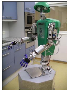
Fig. 1. Humanoid robot in the robot kitchen at the SFB 588 lab in Karlsruhe

Abstract —Future life pictures humans having intelligent humanoid robotic systems taking part in their everyday life. Thus researchers strive to supply robots with an adequate artificial intelligence in order to achieve a natural and intuitive interaction between human being and robotic system. Within the German Humanoid Project we focus on learning and cooperating multimodal robotic systems. In this paper we present a first cognitive architecture for our humanoid robot: The architecture is a mixture of a hierarchical three-layered form on the one hand and a composition of behaviour-specific modules on the other hand. Perception, learning, planning of actions, motor control, and human-like communication play an important role in the robotic system and are embedded step by step in our architecture.