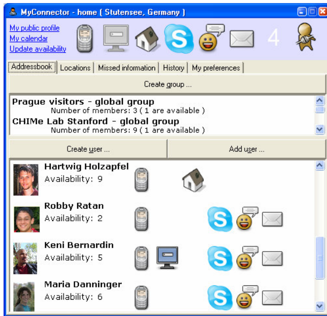
Figure 2. Screenshot of the MyConnector Windows XP client. Symbols in the contact list show how someone can be contacted and initiate contact on click.

Figure 2 shows a screenshot of the MyConnector PC application, running primarily on WinXP. Along with phone communication, it lets the user send emails, send instant messages, and allows conference calls (via the Skype API).