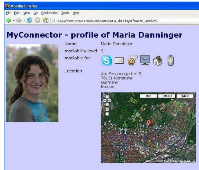
Figure 3. Web interface showing a public profile.

User profiles and current availability are also viewable from web browsers, through the myConnector.net domain. Each user has a public profile accessible by anyone and different custom profiles which typically have more detailed information for selected individuals. Figure 3 demonstrates a public profile. We integrated the Google Maps service to display the current location of a user. Also, an overall availability level and details of the person's current location is displayed. Icons indicate availability for different communication media; some active icons may be clicked to contact the person. The level of information granularity displayed is user-defined in the owner's privacy settings.