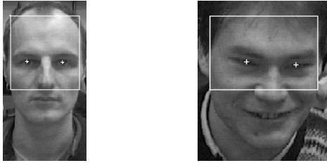
Figure 3. Search area for eyes

Figure 3 shows the search windows for the eyes and found eyes for two faces.