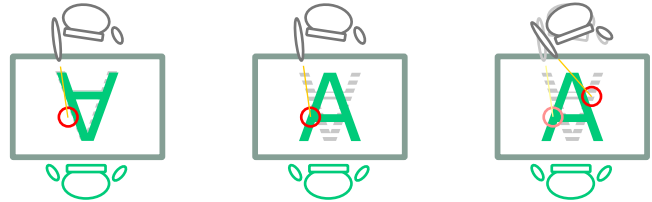
Figure 1: PPVR of the user on the bottom. Note: Green content is only visible to the bottom user and gray-striped content is only visible to the top user. Left: real-life view, table content is inverted. Center: Rotated content, but indicated position is wrong. Right: Rotated content with modified avatar and indication, correct location is marked.