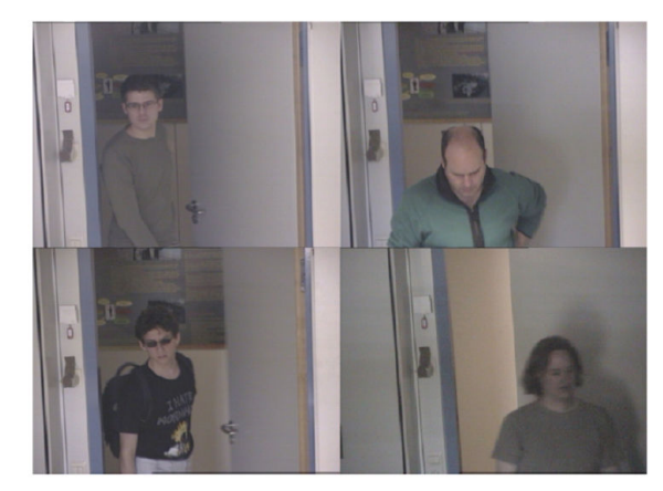
Fig. 1. Sample images from the door monitoring system

Faces are detected in a two-stage process. First, regions of interest are determined by skin color segmentation, and then the eyes are detected with a classifier cascade of Haar-like features [6]. The eye positions are used to register the faces to a fixed orientation and scale (Fig. 2). Please note the variations in expression, illumination, pose and resolution as well as blurring effects from movement.