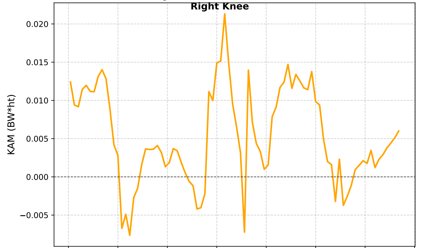
Right Knee Adduction Moment