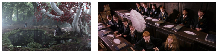
(a) GOT: (Ch3, P8, E01 19:50) At the center of the grove an ancient weirwood brooded over a small pool where the waters were black and cold. (b) HP: (Ch10, P78-79, M 1:06:59) Hermione rolled up the sleeves of her gown, flicked her wand, and said, "Wingardium Leviosa!" Their feather rose off the desk and hovered about four feet above their heads.

Rich descriptions We present in Fig. 3 samples of rich descriptions obtained from the novel and their corresponding video shots which are obtained pseudo-automatically by looking in a small interval.